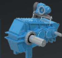
Brevini™ Helical Bevel Helical Gearboxes Posired N Series