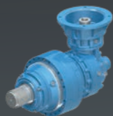
Brevini™ Industrial Planetary Gearboxes