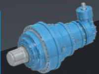
Brevini™ Industrial Planetary Gearboxes S Series