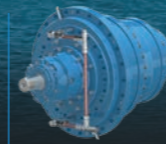
Brevini™ Winch Drives SLW Series