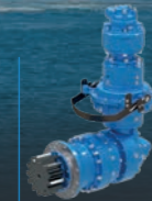
Brevini™ Industrial Planetary Gearboxes